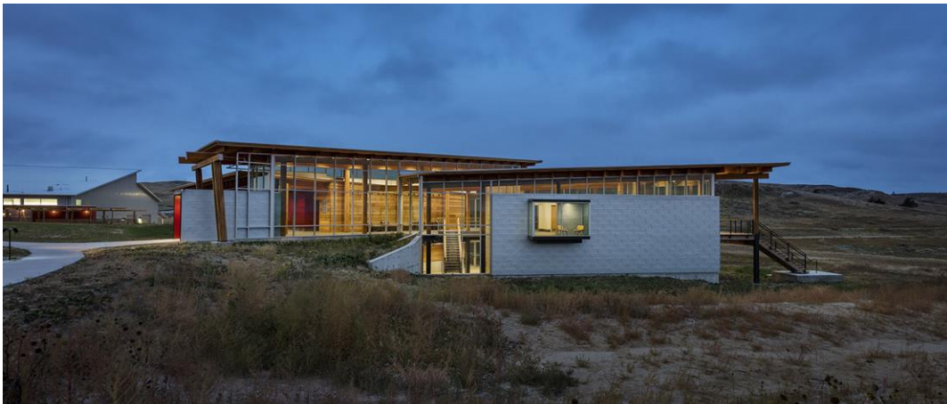
Chadron State College, Rangeland Lab facility